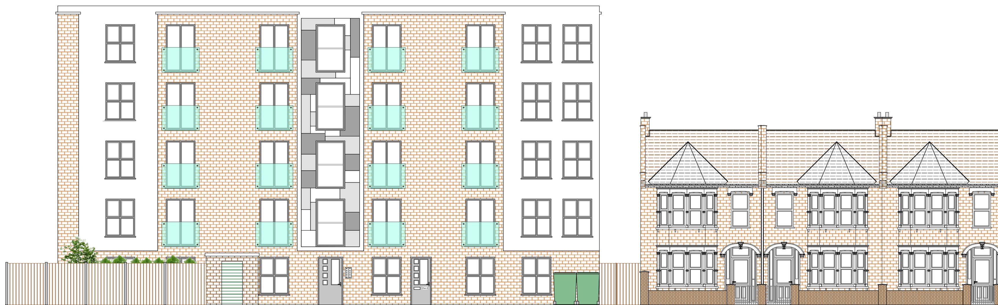
Street View Scale: 1:100

Please note that before building works commences, it is the responsibility of builders or owner to serve party wall notices to all neighbors. Dimensions All dimensions to be checked on site. Contractor to check site thoroughly before work starts and report any discrepancies. Dimensions stated are for guidance only. Contractor to verify all boundary positions and dimensions on site prior to commencing any work, making workshop drawings or buying any materials. Note: simple dimension check of the site has been conducted in order to prepare this scale drawing. Proposed designs have been provided by the client and final designs on this drawing have been approved by the client. No site supervision is implied or undertaken unless otherwise separately arranged. The drawing does not indicate the extent of any excavation works and the contractor is to determine this prior to submitting a quotation for the works or commencing any work. The drawing does not indicate or imply the structural condition of the existing property. The drawings have been prepared for assistance in the preparation of details for planning purposes only. No check dimensions have been taken.